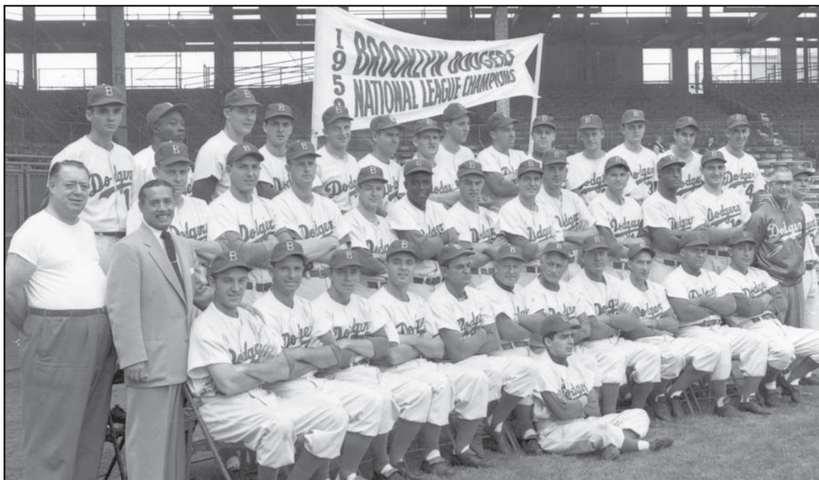
The Brooklyn Dodgers, National League Champions in 1953.