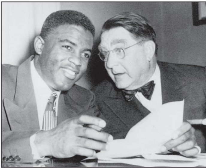
Jackie Robinson and Branch Rickey signing the contract.

Rickey sent scouts to Cuba, Puerto Rico, and the Negro Leagues, where they found Jackie Robinson. Robinson was smart and educated. He was an aggressive player with great balance who could quickly change direction. Branch Rickey thought Jackie Robinson just might be the man he was looking for to join the Brooklyn Dodgers team.