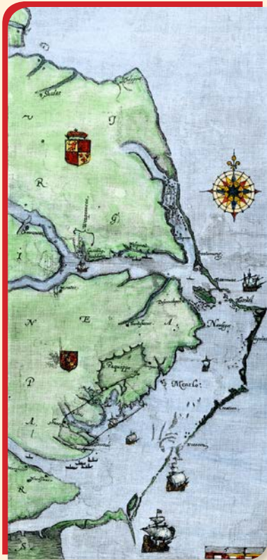
Map of the North Carolina coast made in 1585.

Other historians have looked at local Native Americans. At first, the English considered them friendly and helpful. But some historians believe that the Native Americans began to feel threatened. Vastly outnumbering the colonists, the Native Americans could have wiped them out. In fact, the mysterious word “Croatoan” may refer to a tribe in southern North Carolina.