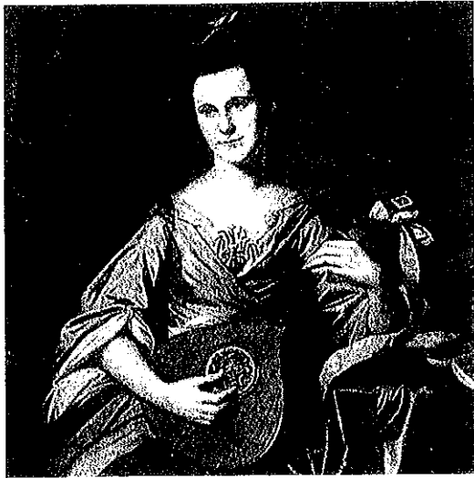
Julia Stockton, the talented daughter of one signer of the Declaration of Independence, Richard Stockton, married another signer, Benjamin Rush. Their son Richard went on to become U.S. minister in England and then secretary of the treasury under President James Monroe.

Foment means to cause something or to intensify its effect. Iniquitous (in-ICK-kwit-uss) means wicked or sinful. A scheme (SKEEM) is a plan or idea.