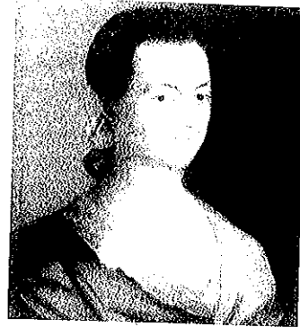
Abigail Adams never stopped reminding her husband, John, about the inequality of opportunity for women in America compared with men. But he didn't listen.

How many women fought and weren't discovered? Well, if they weren't discovered, and didn't write it down later, we'll never know.